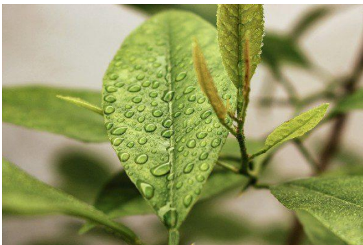
Sustainable Ecosystems & Collective Action