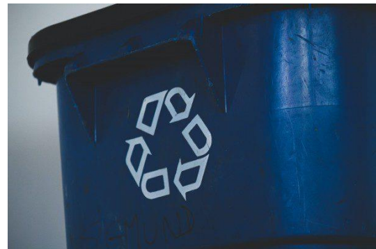
Energy & Resource Efficiency