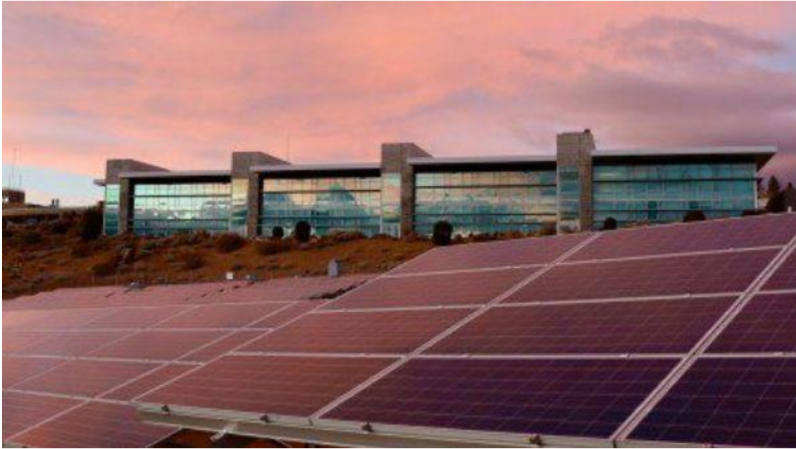
Sustainable Infrastructure Buildings