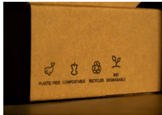
Sustainable Futures for Business Centres